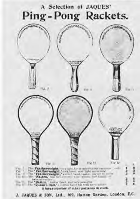
A selection of Jaques' rackets as advertised c 1900

The top sets were clearly designed for high society, with elegant battledores (one with a thinner handle for the lady's more genteel hand), finely turned and polished posts on solid brass clamps and 'Match' balls quite remarkably similar to today's. The 'Rules and Directions' are usually missing but give an illustration of table tennis as an after-dinner diversion with ladies and gentlemen in earnest competition - although still in formal evening dress. The atmosphere is entirely relaxed and congenial, an example to us all, perhaps, in these more fiercely competitive days.