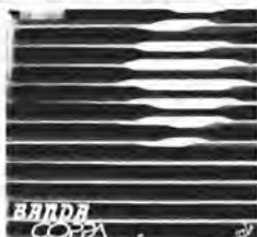
COPPA Fast/Medium Spin