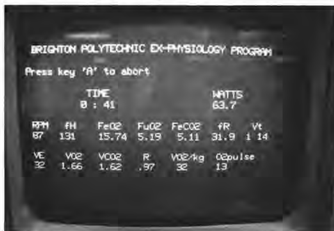
Heavy breathing data