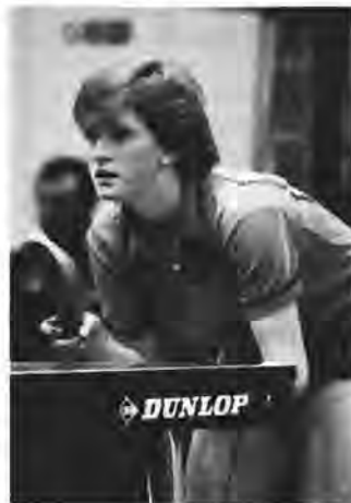
Getting down to it