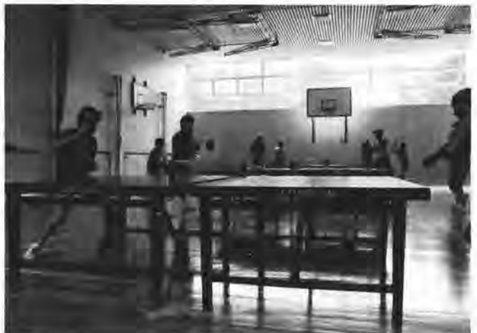
All the top players spend a great deal of time on basic practice