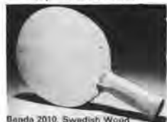
BANDA Controlled Attack

All the blades illustrated are available in all 3 handle shapes