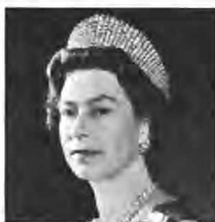
Patron: HM The Queen