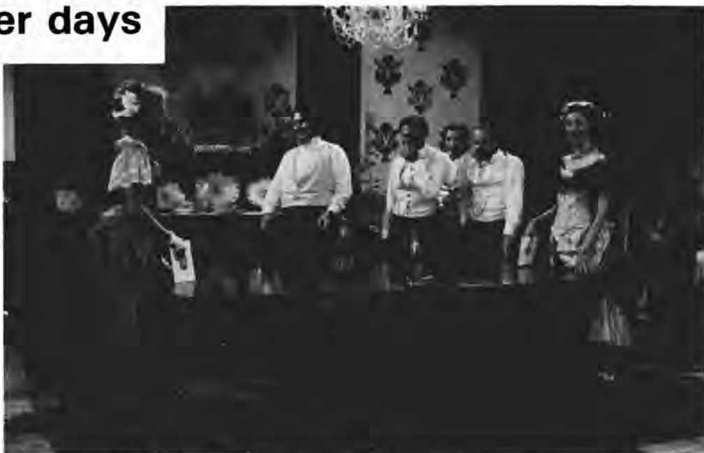
Ping-pong on the dining room table — highly civilised

We can well imagine that some lawn tennis players, frustrated by the vagaries of the English weather, borrowed some toy battledores from the nursery and soon improvised a makeshift net - two bottles and a piece of string or a broom handle resting on two chairbacks and draped with newspaper.