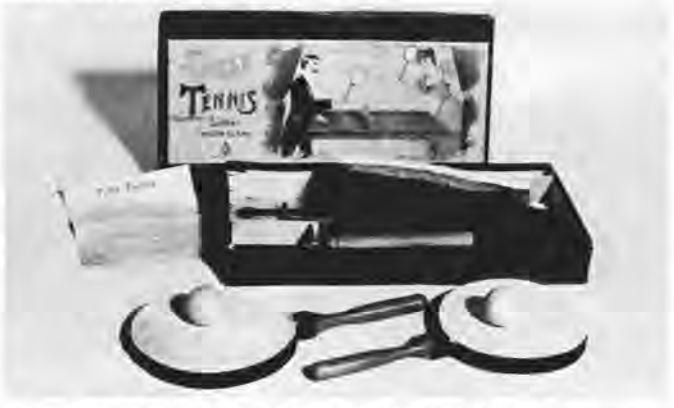
Victorian or Edwardian table tennis set with "drum racquets". Often (as here) the contents do not match up to the illustration

In this report, reproduced here by permission of 'Table Tennis Report', he reveals some of the fascinating history behind this season's Triumph Adler English Open.