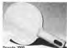
DORADA Super Fast Attack