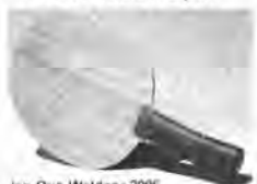
WALDNER OFFENSIVE Fast Attack