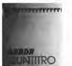
QUATTRO Controlled Spin